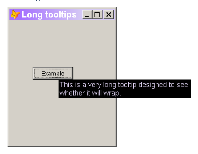
Figure 2. Wrapped tooltip. In VFP 8, tooltips automatically wrap.

However, in VFP 8 you can force a line break in a tooltip by including CHR(13) in the tip. For example: