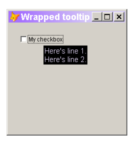
Figure 3. Forcing tips to wrap. You can force a tooltip to wrap by including CHR(13).

Even with the new abilities, keep in mind the "tip" portion of the name "tooltip." Tooltips are intended to provide a quick reminder of the function of a particular control. They shouldn't substitute for good documentation or good design. Consider using both tooltips and messages on the status bar (StatusBarText property) to provide a shorter and a longer description of a control.